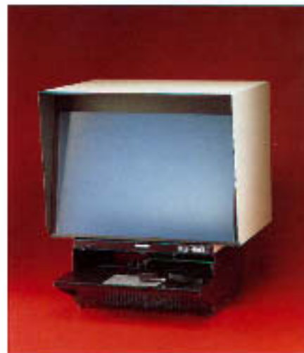
Bell & Howell EDR100 (Aperture Cards)