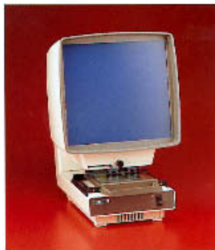
Bell & Howell S100 (3/4 COM, Full Source)

Screen: 313mm (W) x 282mm (H) rear projection Dimensions: 355mm(W) x 530mm(H) x 495mm(D) Weight: 6.8 kg Carrier: 105mm x 152mm (4" X 6") self-opening Magnifications: 21X, 24X, 32X, 36X, 42X, 48X, 54X Lens Assembly: Dual lens facility, one lens fitted Focus: Front-mounted Illumination: 13.8V 30W dual intensity Electrical: 230V 50Hz Construction: High impact plastic