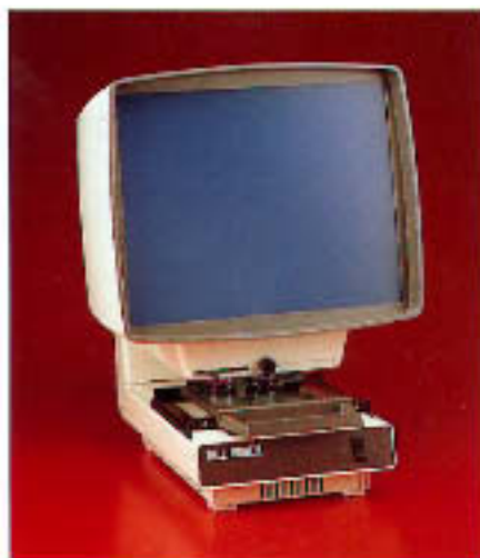
Bell & Howell C100 (Full COM)

Screen: 360mm(W) x 282mm(H) rear projection Dimensions: 400mm(W) x 530mm(H) x 495mm(D) Weight: 6.8 kg Carrier: 105mm x 152mm (4" X 6") self-opening Magnifications: 21X, 24X, 32X, 36X, 42X, 48X, 54X Lens Assembly: Dual lens facility, one lens fitted Focus: Front-mounted Illumination: 13.8V 30W dual intensity Electrical: 230V 50Hz Construction: High impact plastic