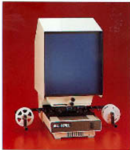
Bell & Howell S75 (3/4 COM, Full Source)